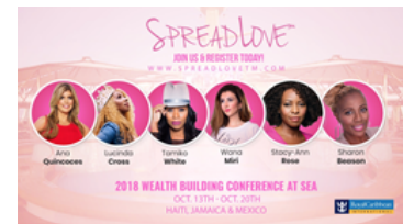
2018 Wealth-Building Conference at Sea

To learn more and register, visit http://www.spreadlovetm.com . To learn about sponsorship and vending opportunities to promote your